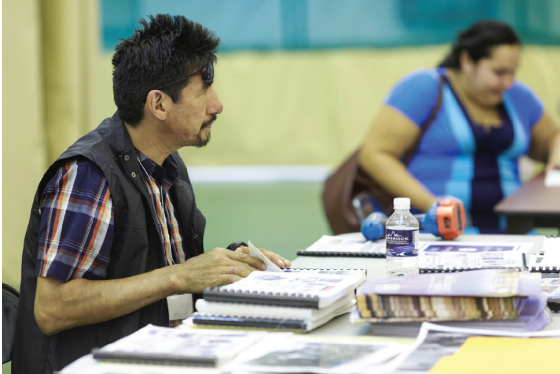
Figure 2: Shingwauk Gathering participants looking at Residential School photo albums, 2012.

In addition to creating spaces for care while accessing archival material, the SRSC facilitates connections to family and family history. Residential Schools disrupted Indigenous families' lives for generations, with many children being separated from their parents and siblings for years at a time. Residential Schools and other forms of colonial oppression removed Indigenous peoples from their families, culture, communities, and identities. The SRSC emphasizes supporting kinship connections in recognition that each photograph and document connected to Residential Schools tells a history and has the potential to provide ties to kin. How does archival practice change when focusing on ongoing kinship ties instead of maintaining static documents? It means that archival records are continually updated and expanded and that archival records are part of living and ongoing history. At the SRSC, Survivors and their families actively contribute to how photographs are described, who is identified in photographs, and decisions around descriptive language.