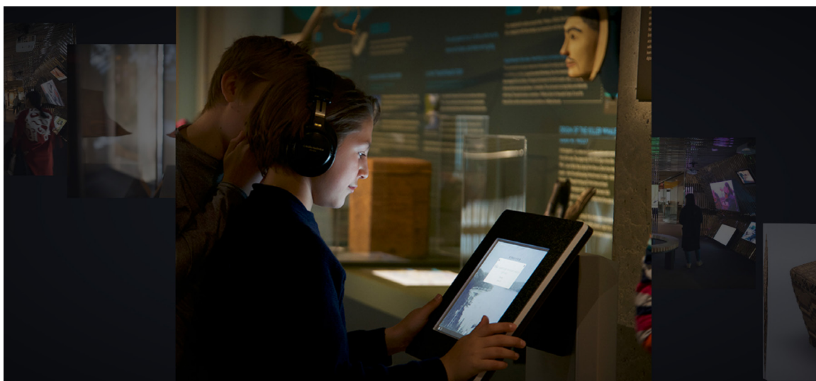
Figure 8: Museum of Anthropology attendee looking at the iPad in the “Culture at the Centre” exhibit, 2018.

We believe that the strategies, approaches and modest successes of the Heiltsuk Language and Culture Mobilization Partnership may be informative for other community-based language reclamation projects, and we hope that outlining our experiences and being open about the challenges such partnerships face may assist others engaged in this urgent and timely work.