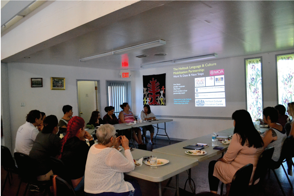
Figure 1: Meeting between the Heiltsuk Tribal Council and the Heiltsuk Language and Culture Mobilization Partnership, July 2018.