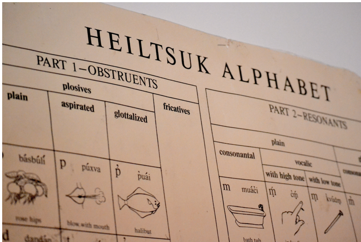
Figure 5: Heiltsuk Alphabet Chart, 2018.

Indigenous Storybooks to retype, digitize and host five beautifully illustrated storybooks published by the Heiltsuk Language Programme in 1988 (Figure 6).